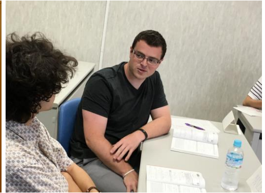
Survival Japanese Class