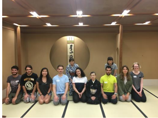
After Tea Ceremony