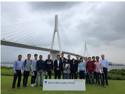
Tokyo Gas Ohgishima LNG