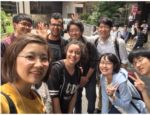
Orientation & Campus Tour